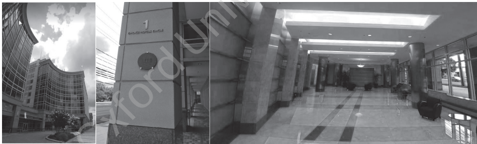
Fig. 1.3 Views of the LEED Platinum certified building in Rockville, MD, USA

Figure 1.3 shows the views of a LEED Platinum certified building in Rockville, MD, USA.